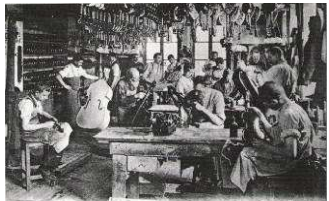
The assembly room of Maison Laberte-Humbert Frères, in Mirecourt in the early 20 th century.

Mirecourt, the Cradle of the French school: The legend attributed to a certain Tywersus the origin of stringed instrument making in Mirecourt at the beginning of the 16 th century. Tywersus, an eminent Italian luthier from Cremona and a former servant of the Duke of Lorraine, established himself in Mirecourt, a small city in the East of France and trained several disciples. The parochial and official archives feature apprenticeship contracts, the oldest of which dates from 1629. This is nearly a century before the constitution of instrument makers as a trade, an organization ordered by the duchess Elisabeth-Charlotte and enshrined in the charter signed on 15 May 1732.